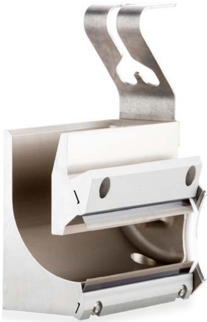
Chambers with optimized design

In order to achieve an optimum reliability and perfect print quality the new ink chambers are constructed more robust. In combination with the new rounded shape of the ink channel this leads to an improved ink circulation and convinces with a lower tendency to ink spitting and air inclusions.