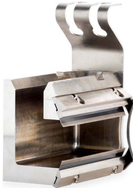
Chambers with conventional design