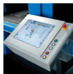
Total information system: The sliding control panel with touchscreen and user-friendly menu navigation.