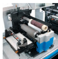
Sleeve technology for printing cylinders and anilox rollers ensures minimum setup and changeover times in flexographic printing. The chambered doctor blade is standard, making ink changes child's play.