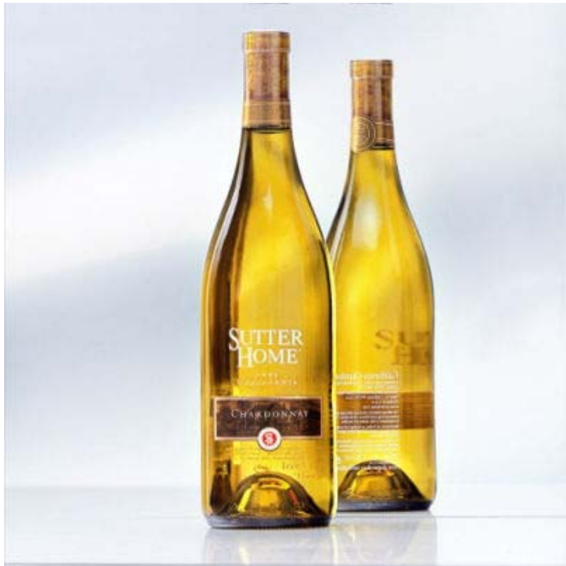
Figure 1: Example of no-label look decoration