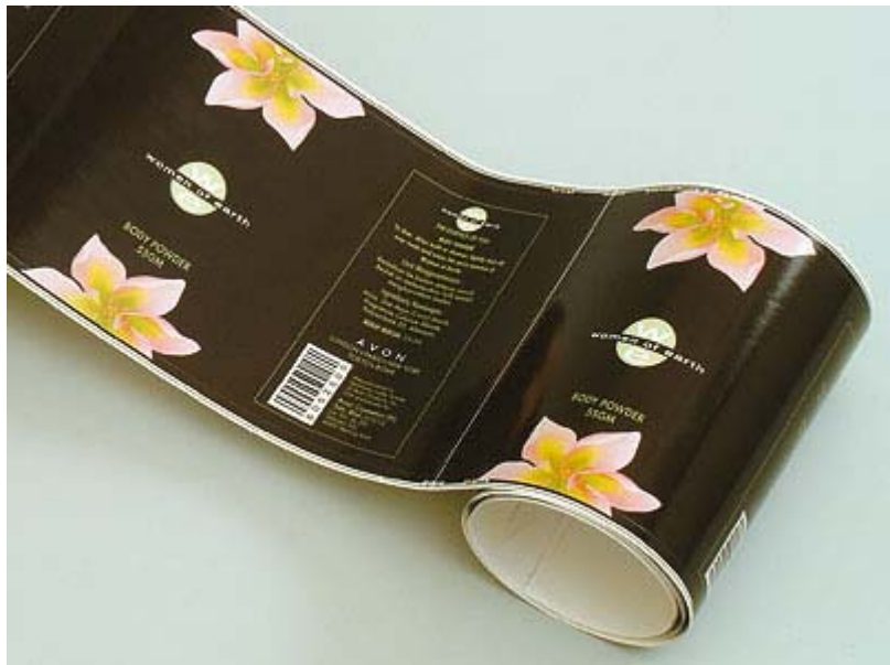
Silver (paper substrate): Super Enterprise