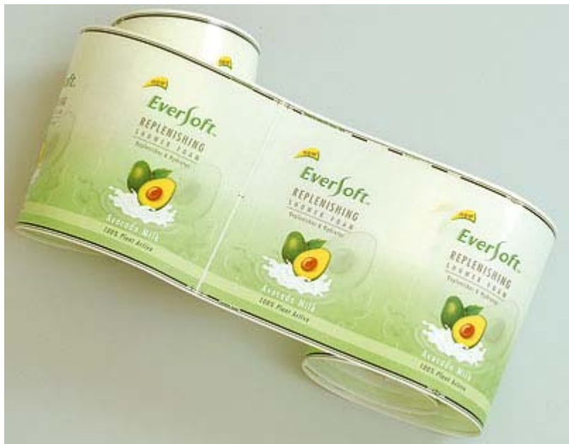
Silver (filmic substrate): Super Enterprise