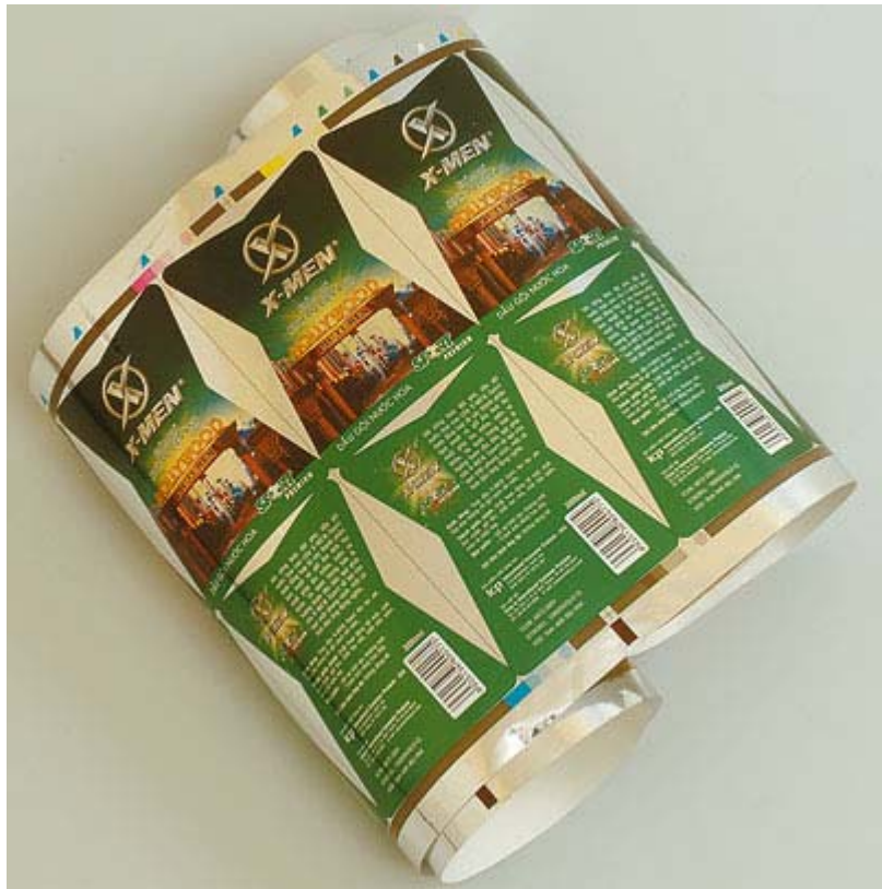
Gold (filmic substrate): Pemara Press