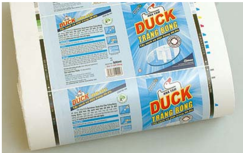
Bronze (paper substrate): Pemara Labels