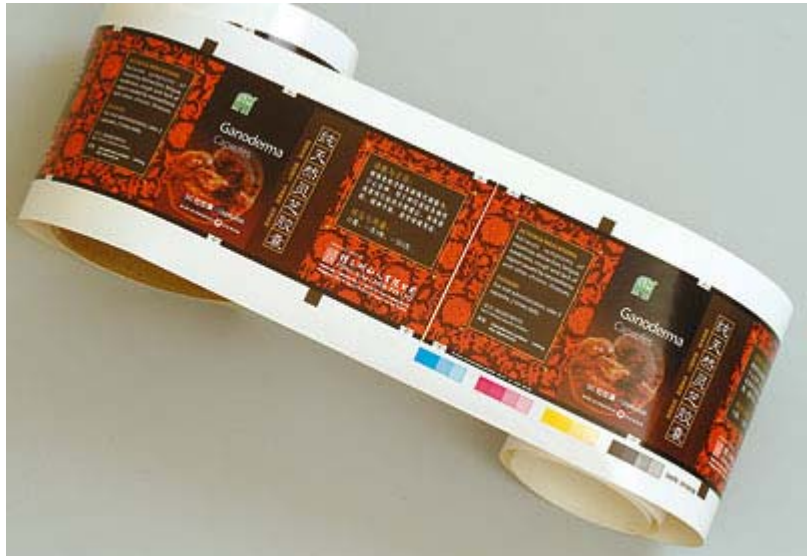
Bronze (filmic substrate): Winson Press

AFTA, the Asian Flexographic Technical Association had organized the awards with the goal to promote quality printing in the region that is representing more than half of the world's total population . The entries were judged on a wholly quality oriented set of criteria; the Judges had been selected from within Asia and from around the world and are recognised experts in their areas of expertise.