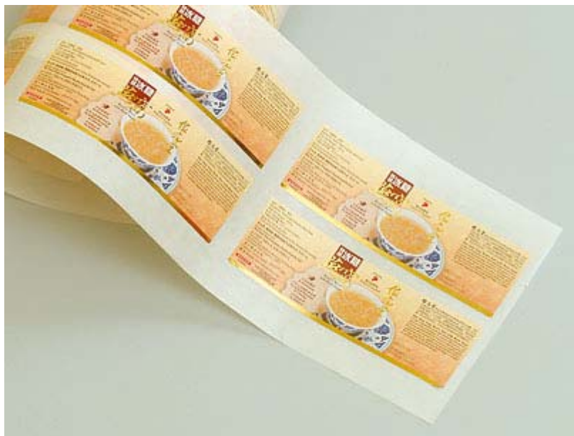
Silver (paper substrate): Winson Press