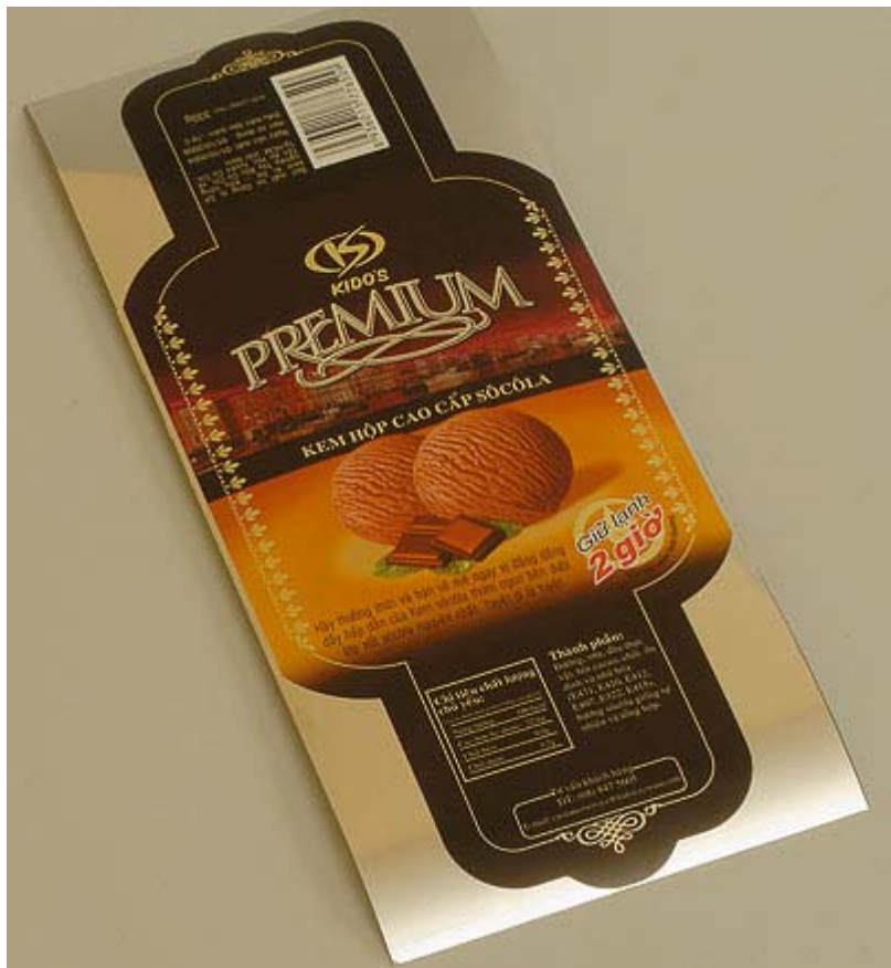
Gold (filmic substrate): Anlac Labels