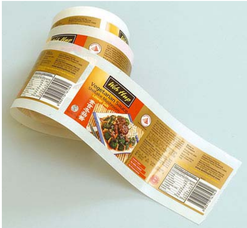
Gold (paper substrate): Winson Press