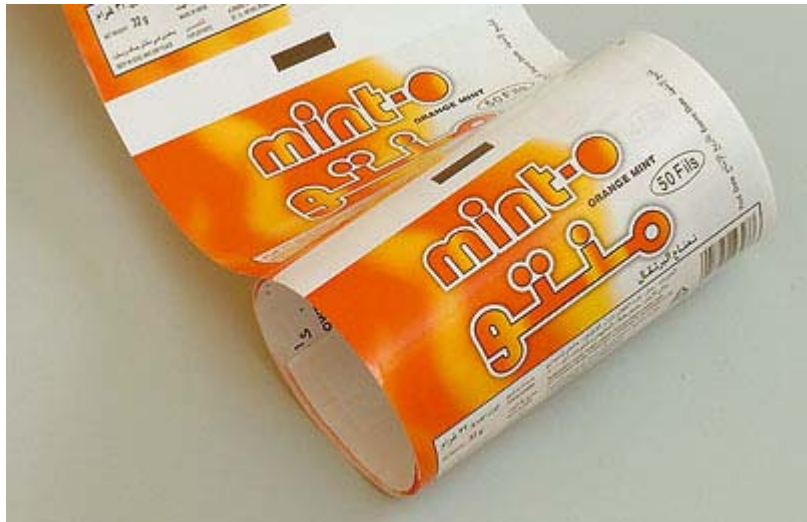
Bronze (paper substrate): Wintek Flexo Prints